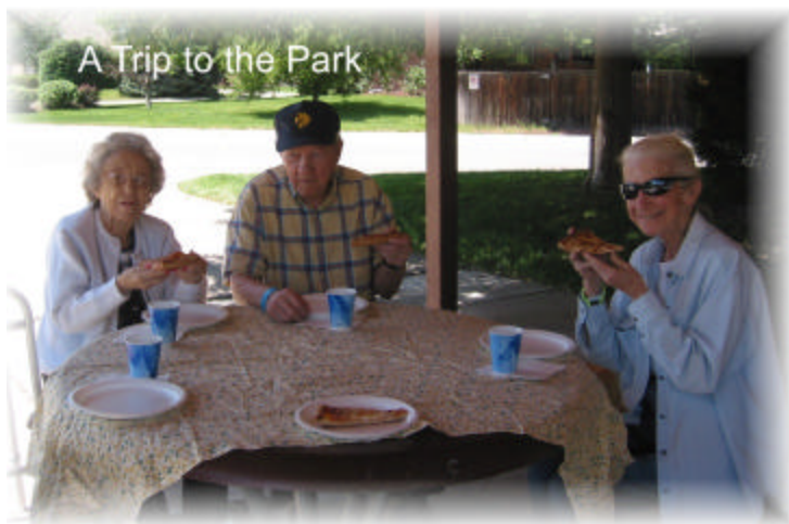
4th of July Party