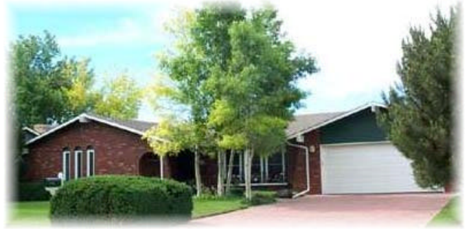
Six Homes in the Littleton Area